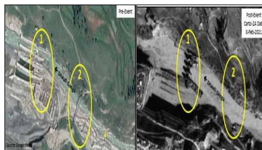
Figure 3: Satellite Images showing Damages to Power Project, (2) Bridge

Rapid damage assessment was carried out of the affected areas using high-resolution satellite images. Indian Cartosat-2S images show damages at NTPC Power Project at Tapovan (Figure 3& 4). Table 2 shows the details of lives lost and damage/loss to infrastructure.