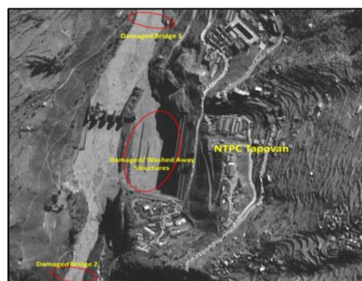
Figure 4: Satellite images showing Damages at NTPC, Tapovan